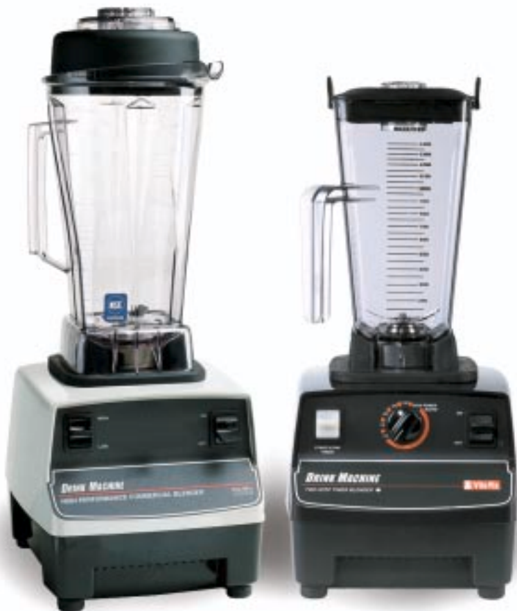
Two-Step Timer Drink Machine with black base